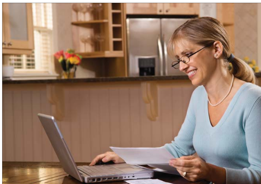
Wandsworth residents once again see no increase in council tax bills as both Boris Johnson and the local council work hard to freeze rates