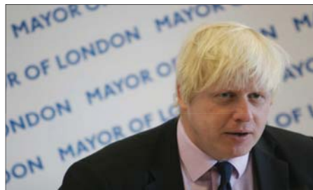
INSIDE: Boris tackles City Hall waste to deliver tax freeze this year