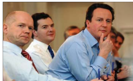
BACK: David Cameron on the change our country needs