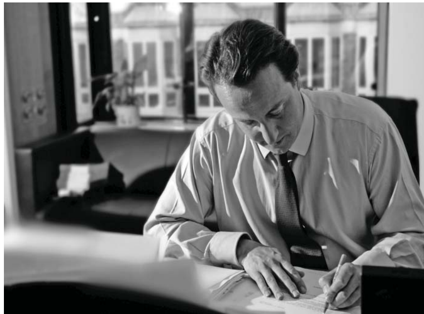
DAVID CAMERON MP CONSERVATIVE PARTY LEADER

With your support we can make sure Britain gets the change it so desperately needs.