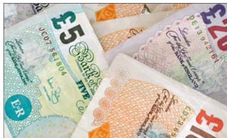
BACK: What Wandsworth is doing to help combat the recession