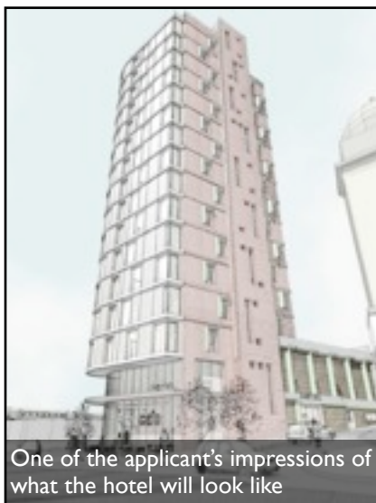
One of the applicant's impressions of what the hotel will look like

The Planning Service Wandsworth Council Wandsworth High Street London SW18 2PU