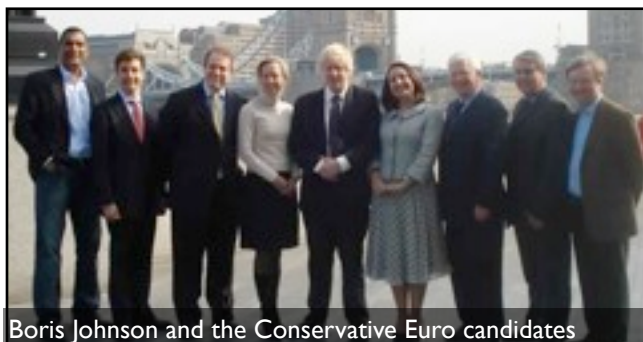
Boris Johnson and the Conservative Euro candidates